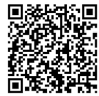
EdExcel ICT GCSE

ICT in Year 7 is also changing and will be delivered as part of the 'World Around Us' project with Geography, History and Drama. Students will still learn the necessary skills and capabilities, but in a more project-based construct.