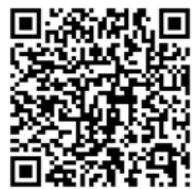
AQA Computer Science GCSE