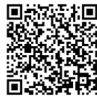
OCR Applied A' Level ICT