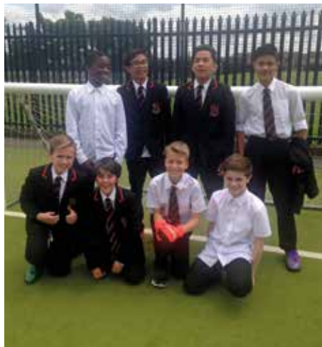
Sweden & Spain (Year 8)