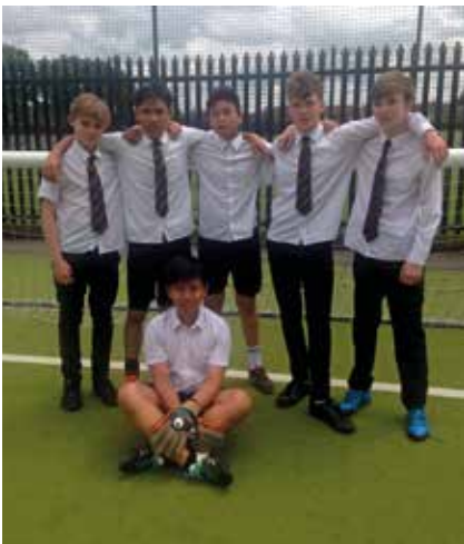
England & Hungary (Year 7)

After some competitive matches the finalist were as follows: