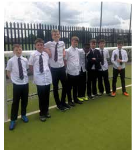
Albania & Czech Republic (Year 9)