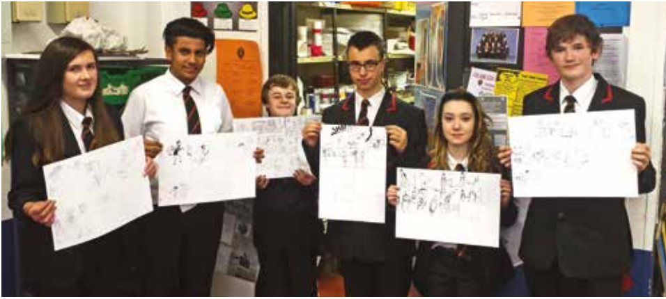
Illustration Workshop Competition